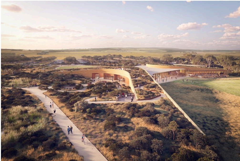
Image labelled: "Artist impression of the Twelve Apostles Visitor Experience Centre – subject to change."

See: https://www.rdv.vic.gov.au/grants-and-programs/twelve-apostles-precinct-redevelopment